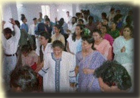
Students break out in Worship during Graduation Ceremonies