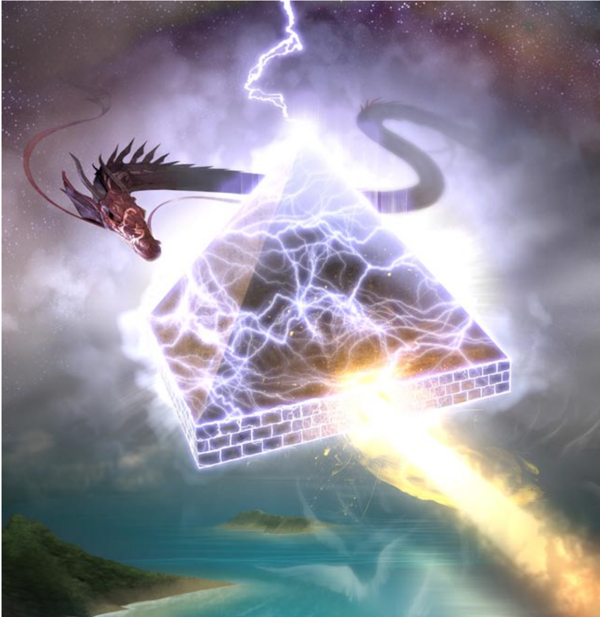
Illustration of Satanic Mountain

The time ended with personal prayer for pastors and intercessors. Our host, in closing, solemnly reminded Ciptaan Baru members to remember their commitment to pray. I was informed that the Ciptaan Baru intercessors met twice a week at their two prayer houses (rumah doa) , and also daily prayer was offered in different locations from 8-12noon.