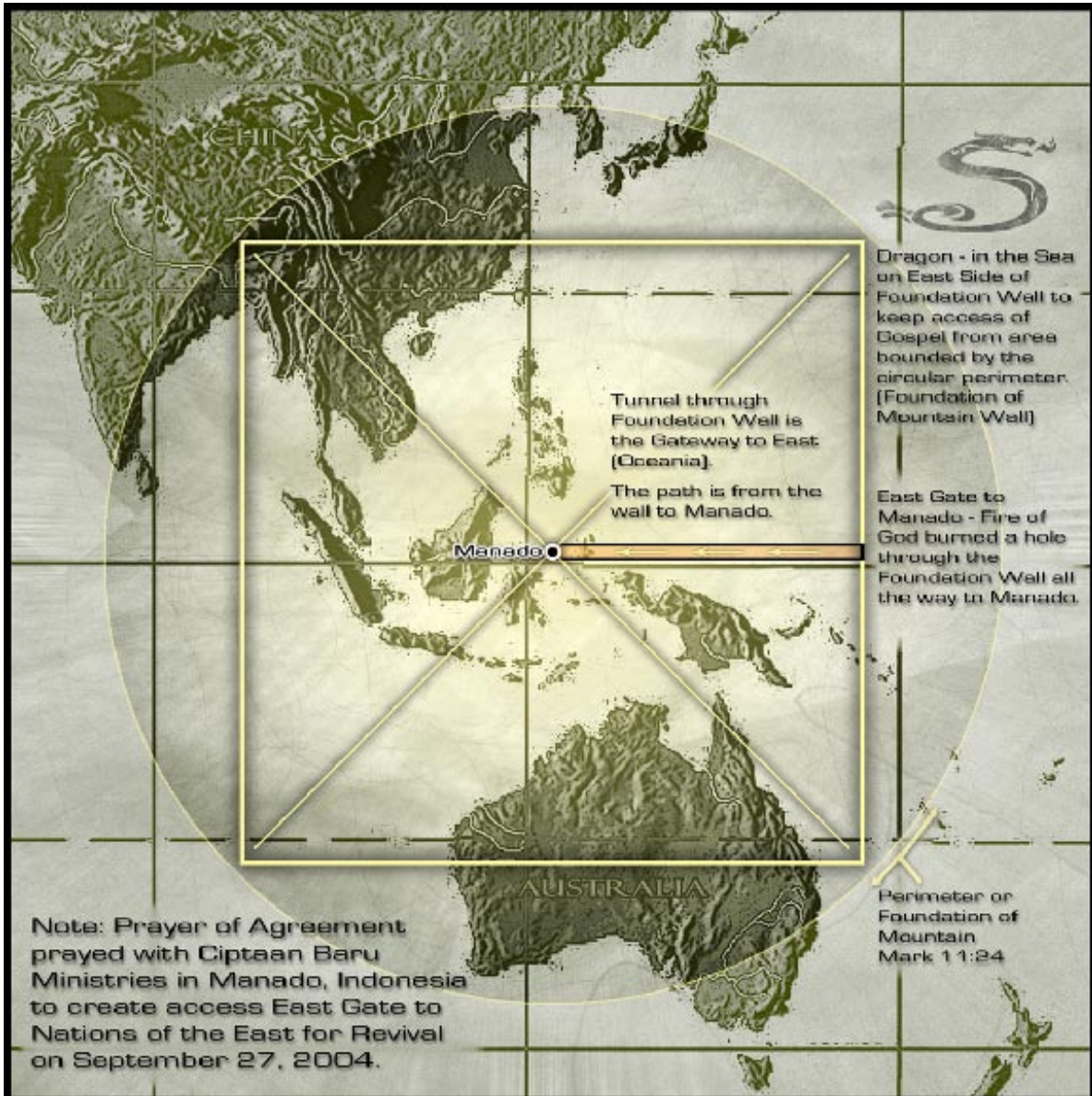
Illustration of Area impacted by Satanic Mountain

This opening will grant angelic access and close or partially close this gate of hell in this region. Bringing the Lord's battle to this gate will bring revival to the nations of Oceania in the Far East.