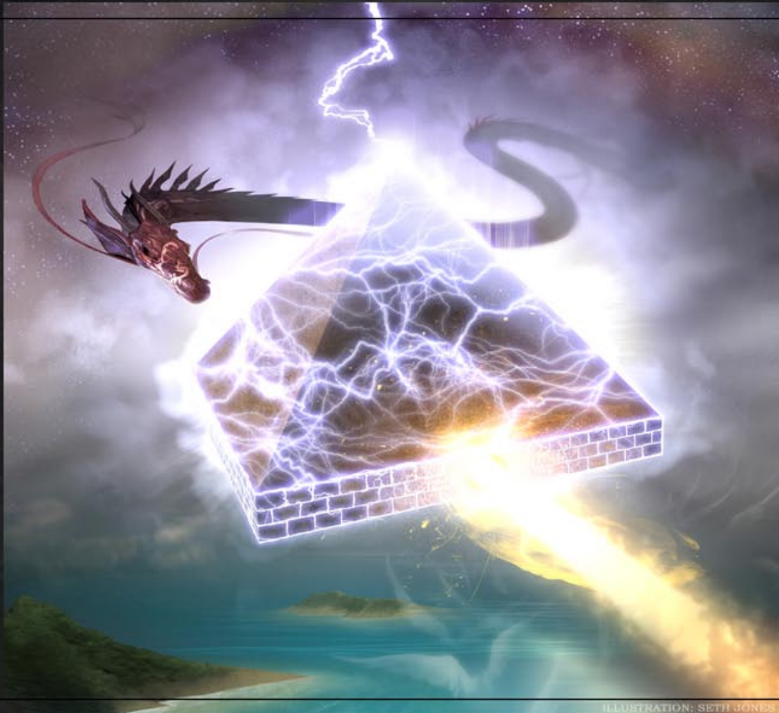
ILLUSTRATION: SETH JONES